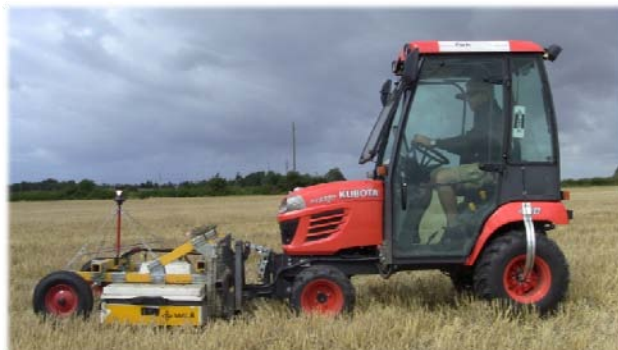
Figure 1: GPR measurements with the 16 channel 400 MHz MALÅ Imaging Radar Array (MIRA) with 8 cm channel spacing using a robotic total-station together with a prism for automated data positioning.

In collaboration with the Swedish LBI ArchPro partner, the Contract Archaeology Unit of the Central Swedish Heritage Board, and Prof. Larsson in August/September 2010 a team from the LBI ArchPro, started motorized magnetic and GPR surveys at Uppåkra. In total 40 hectares of magnetic and 10 hectares of GPR measurements were conducted over the course of seven days. The magnetometer system used, consisted of five Foerster gradiometer probes mounted with 50 cm spacing on a non-magnetic trailer, towed by a Quad bike. The novel GPR system employed was a 16 channel 400 MHz MALÅ Imaging Radar Array (MIRA) with 8 cm in-line and 8 cm cross-line trace spacing (Fig. 1), mounted in front of a small tractor (Trinks et al. 2010). In April 2011, the fieldwork continued with the intention to cover all accessible areas surrounding the known Iron Age settlement site using magnetic prospection.