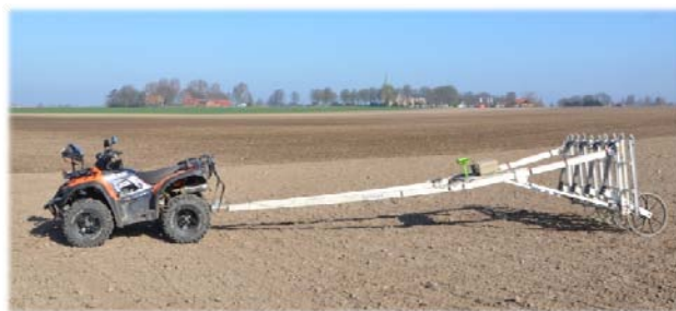
Figure 2: Motorized magnetic survey with 10-channel Foerster gradiometer array mounted with 25 cm probe spacing on a non-magnetic cart in April 2011. The RTK-GPS antenna for data positioning is visible on the cart. In the background Uppåkra church can be seen.

Additionally, a high-resolution digital terrain model of the central area was generated by using terrestrial laser scanning with a Riegl LMS Z420i. The application of two motorized magnetometer systems with five and ten channels (Fig. 2) made it possible to acquire more than 110 hectares of magnetic data over the course of nine measurement days. The investigated area located in wide open farmland offers perfect measurement conditions. The friendly support of the landowners, the University of Lund, and the Uppåkra Arkeologiska Center made it possible to survey the so far largest interconnected archaeological magnetometer prospection area in Scandinavia, covering in total over 1,75 km 2 (Fig. 3).